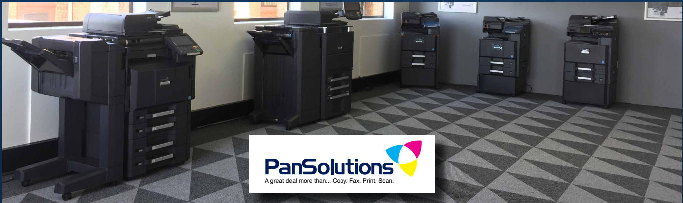
KYOCERA LOW, MEDIUM AND HIGH VOLUME A4 AND A3 COLOUR/ MONOCHROME MULTIFUNCTIONAL DEVICES