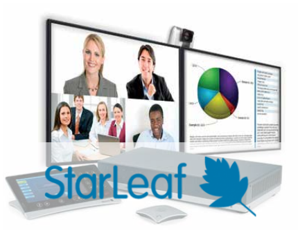
STAR LEAF VIDEO CONFERENCE SOLUTIONS