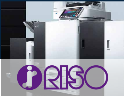
RISO COMCOLOR INDUSTRIAL HIGH VOLUME PRINTERS