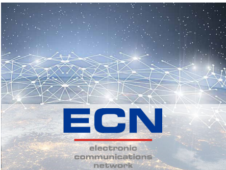
ECN VOIP SOLUTIONS