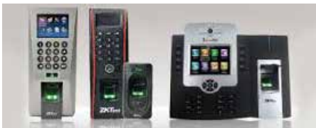
A WIDE RANGE OF ACCESS CONTROL