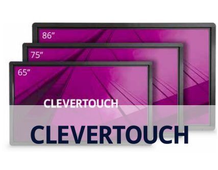
CLEVERTOUCH INTERACTIVE SOLUTIONS