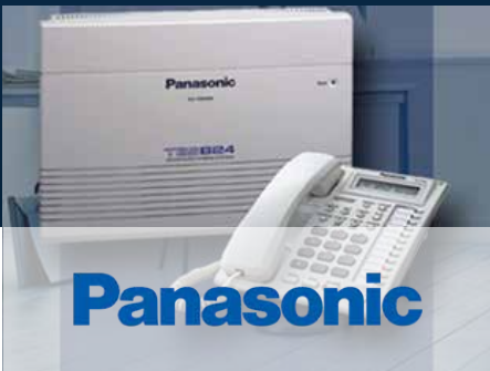
PANASONIC PABX SYSTEMS AND SWITCHBOARDS